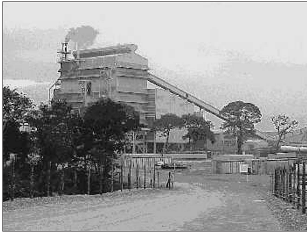
Figure 1—DC arc furnace building at Chambishi

More recently, attention has been focused on the Nkana slag dump on the Zambian Copperbelt. More than six decades of copper mining and smelting at the site near Kitwe, 250 km north of Lusaka, have left behind about 20 million tons of slag grading between 0.3 and 2.6% cobalt. This dump, covering a square kilometre to a depth of about 30 m, is probably the world's largest cobalt resource that is situated above ground. Many attempts have been made over the years to recover cobalt from this dump, and much research has been carried out in this field. Anglovaal Mining Limited (Avmin) of South Africa purchased the reverberatory furnace slag dump at the Nkana smelter and the Chambishi Roast Leach Electrowinning (RLE) plant in 1998 for US $50 million. In July 1999, plans were announced to expand the Chambishi RLE plant to incorporate a US $100 million smelter facility to process the slag, increasing the Chambishi production by 4 kt/a of cobalt and 3.5 kt/a of copper.