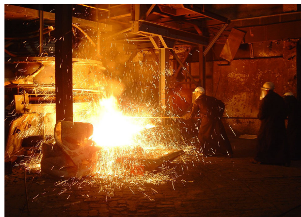
Fig. 2. Tapping the cauldron (pilot furnace) at Mintek (photograph by Geldenhuys, Mintek, 16 April 2004).

furnace is generally controlled from hoppers or storage bins integrated with a mass loss system to monitor and adjust the feed rate and feed ratios to the required levels. Mintek uses continuous, accumulative calculation and manages the power-to-feed balance ratio throughout any given feed period (expressed as how closely the actual power-to-feed ratio is relative to the desired process ratio, i.e. net energy in/mass fed). While the aim is to be perfect at all times, this is obviously never true. This practice can be described via navigational principles applied by pilots. The basic control philosophy described is applied by pilots and furnace operators alike: implement corrective action by evaluating progress against target (Figs. 1 and 2).