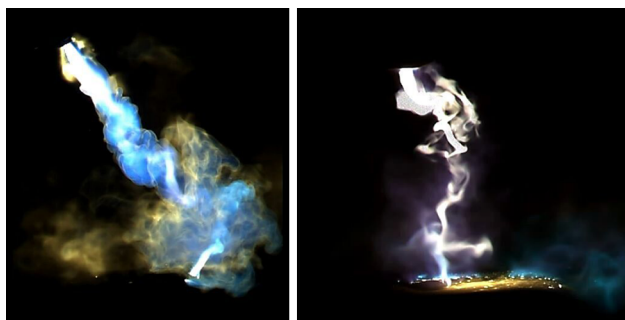
Fig. 1. High-speed photographs of DC arcs: the power of lightning (photographs by Reynolds, Mintek, 24 May 2012).