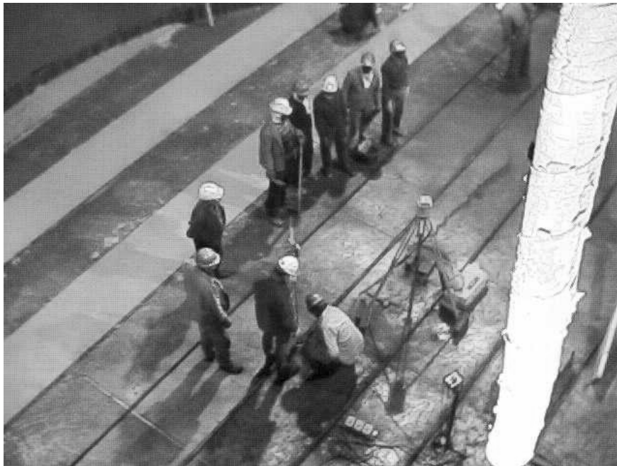
Figure 3. Laying of the carbon blocks in the floor of the furnace.