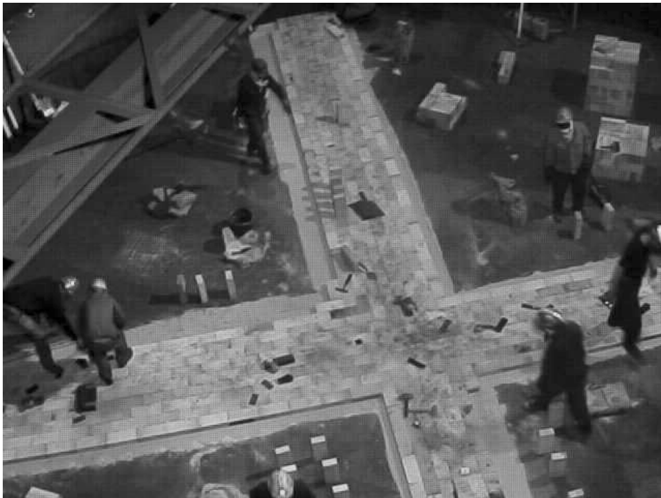
Figure 2. Laying of the ceramic brick in the floor of the furnace.

A final point concerning the design of the lining is that the “freeze” lining is thermally more efficient than the carbon block lining. Without digressing into the thermodynamic motivation of the higher thermal efficiency, the thermal efficiency results in the cost advantages discussed in section 4.2 together with operational advantages in the form of lower off-gas temperatures, and better heat energy distribution in the reaction zone.